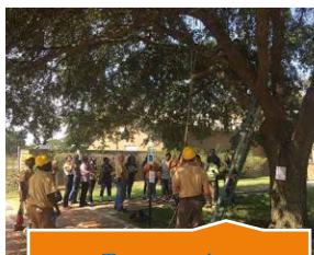
Tree pruning demonstration in progress