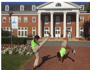
4-H youth ambassadors practice exercise moves