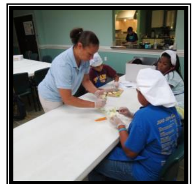
Youth practice healthy meal preparation