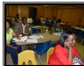
Below: Mansfield training session