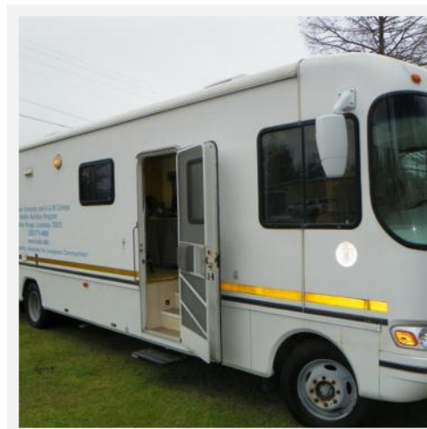
The Mobile unit is equipped with ten workstations and can travel to any community to conduct on-site small business development training

This article has appeared in the Feliciano Explorer , East Feliciana Watchman and Feliciano Voices-The Felicianas On Line , http://felicianavoices.net/FelicianoVoicesToday/SouthernUniversityNews.html .