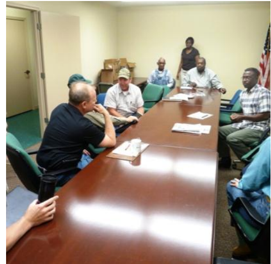
Group discussion during meeting