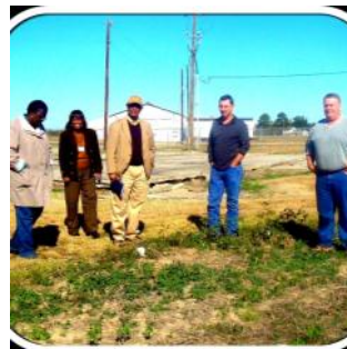
SU Ag Center and St. Landry Parish members at the proposed garden site

coming years. The training will include workshops and hands-on experience in the gardening operation, from raising seedlings, transplanting, maintaining to harvesting.