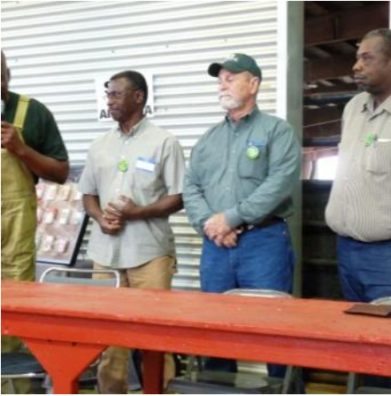
Speakers at “Save Rural America” rally in Amite, March 12